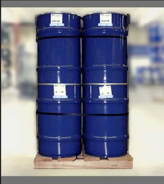
UN Approved Packaging